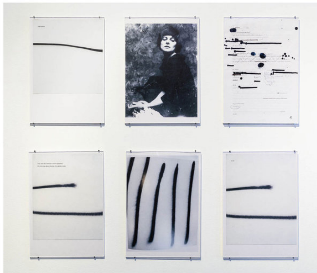
Six collages by Heike-Karin Föll: "my favourite kind of dirt (les bombes) I-V" (2015).

Art in review, from Times critics. JUNE 2, 2016